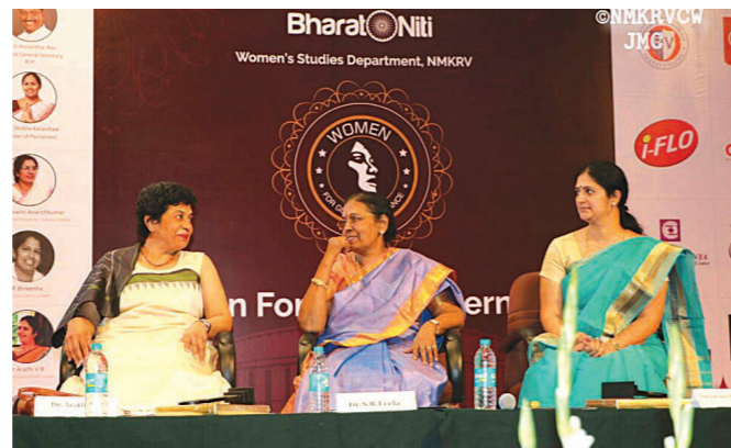
The Panel Discussion in session.