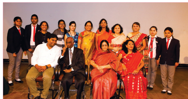
The dignitaries with faculty and students.