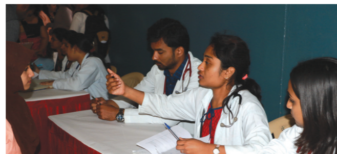
Students and the doctors in the check up.