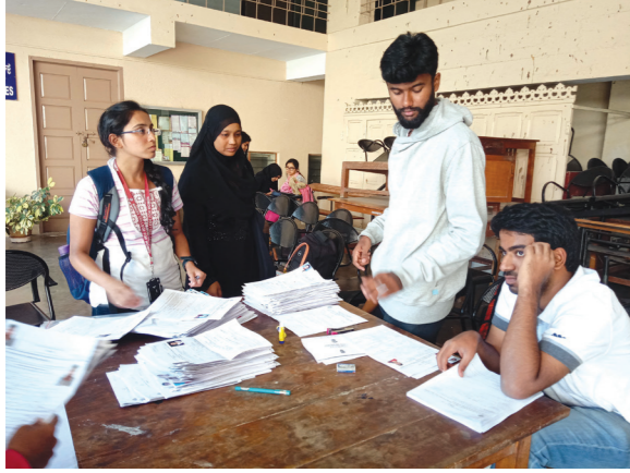
Students participated in the voter registration campaign conducted by NSS and BPAC