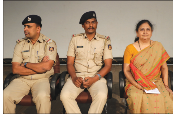
A Security awareness program for the students was conducted by Jayanagar Police.