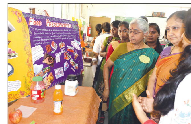
Participants explaining their exhibits.

Principal and Vice-Principal inaugurated the Exhibition. Participants informed the visitors about polymers, pesticides, home remedies, natural and chemical cosmetics, medicinal and biological chemistry. There were live experiments, charts and power-point presentations on Chemistry used in dyes, fireworks, face powder, stamp-pad ink, cleaning powder, etc. Students participated in large numbers. Prizes were distributed to the best exhibits.