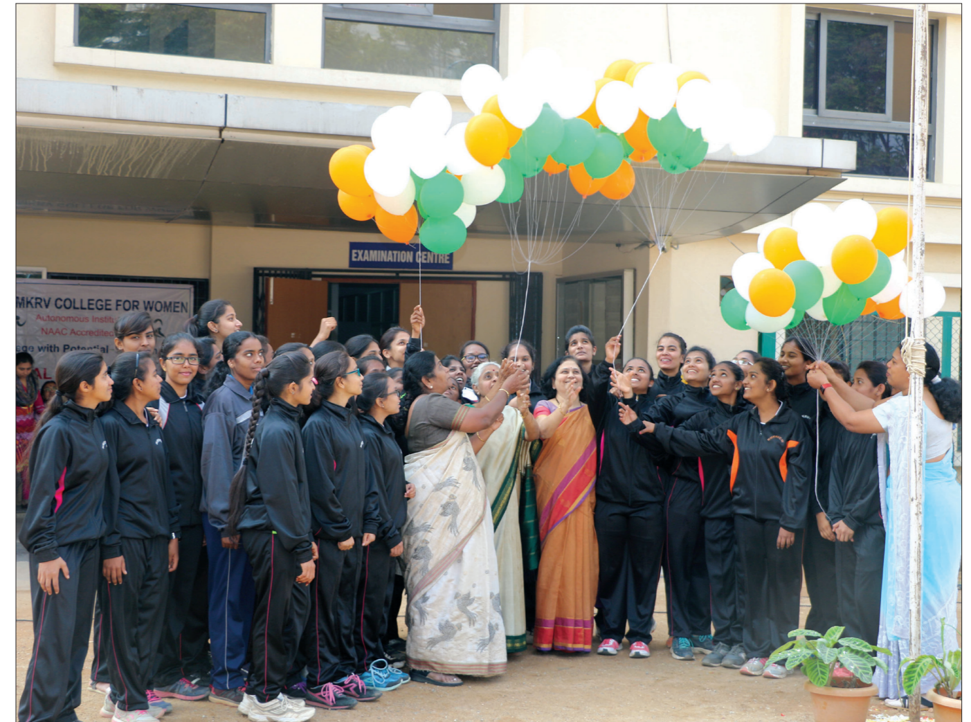
Tricoloured Balloons were released on the occasion of Sports Day.