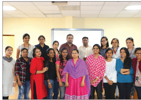
A 'Technical Writing' workshop was conducted for the MA-JMC students.