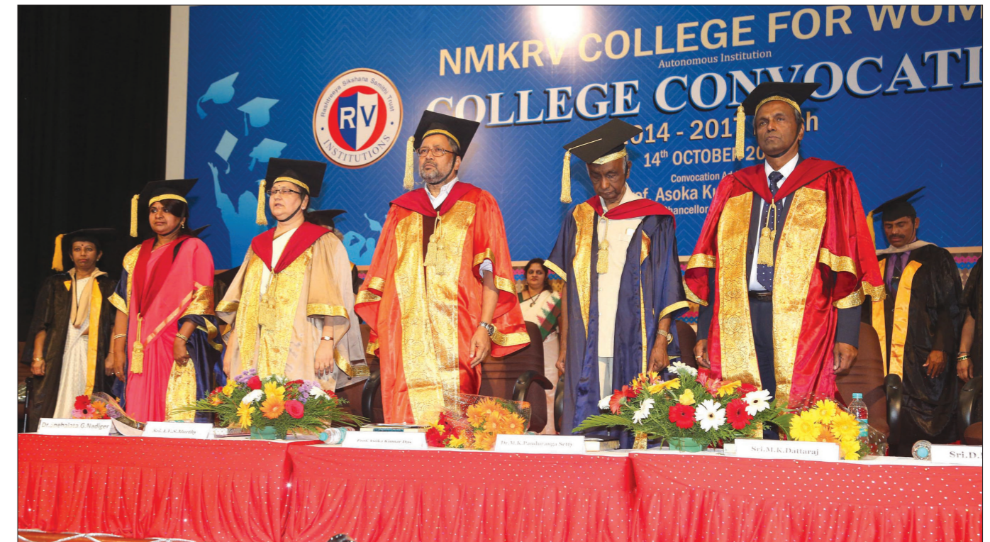
The dignitaries on stage during the National Anthem.