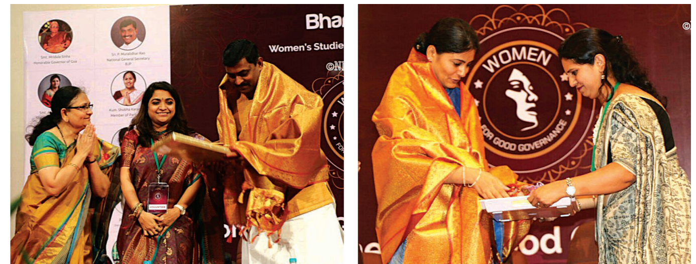
Glimpses of the Conclave