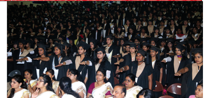
The Oath Administration in progress.