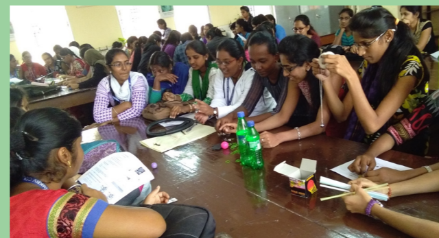
Students in the Trainers Training programme conducted by Eco Club in association with 'Youth for Seva'