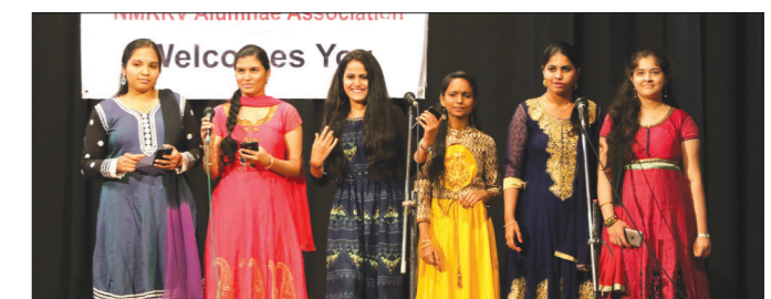
A singing performance on stage.