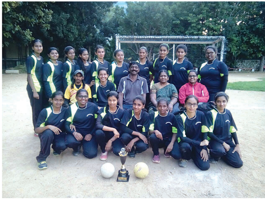
Handball team of the College were the runners up in 'Chri-spo' - an Intercollegiate Tournament held at Christ University.