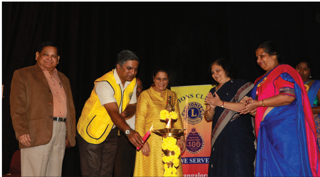
The dignitaries inaugurating the camp.

A free Health Check-up camp for all I year students was organized by Arogya Kendra in Mangala Matapa on 18th January, 2018. The event was organized in association with Lions Club of Bangalore Mind Tree District 317-E, Srushti Foundation and Sri Devaraj Urs Medical College, Kolar.