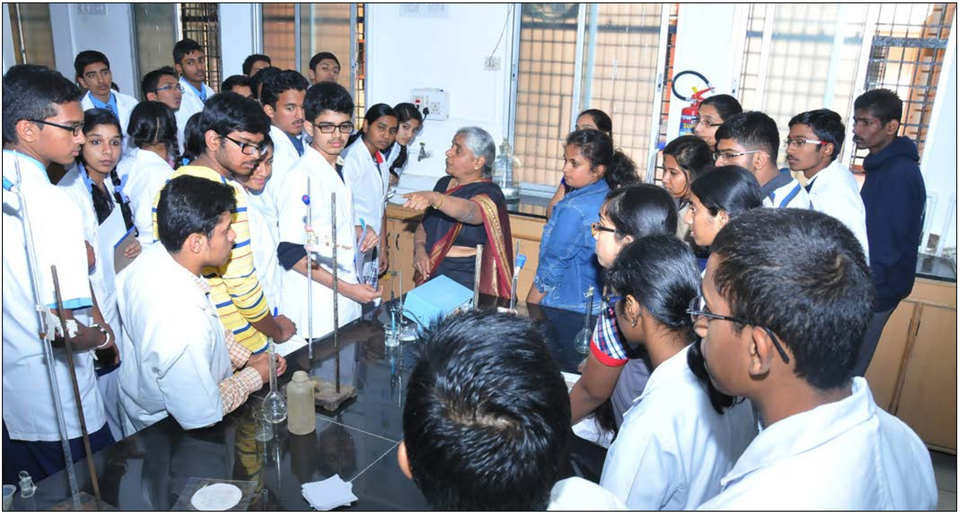
The Vice Principal along with the participants of the INSPIRE Science Camp.