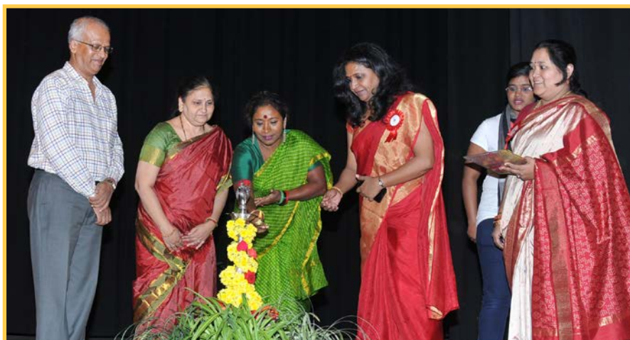
The lighting of the lamp.