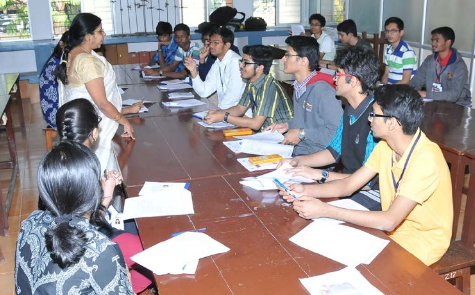
HOD, Botany, interacting with the participants during the lab session.