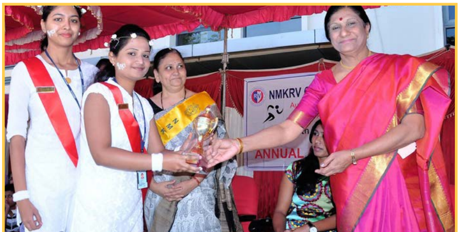
The Chief Guest awarding the students for Best March.

Each section of the college marched for different themes like a tribute to the fallen soldiers, unity