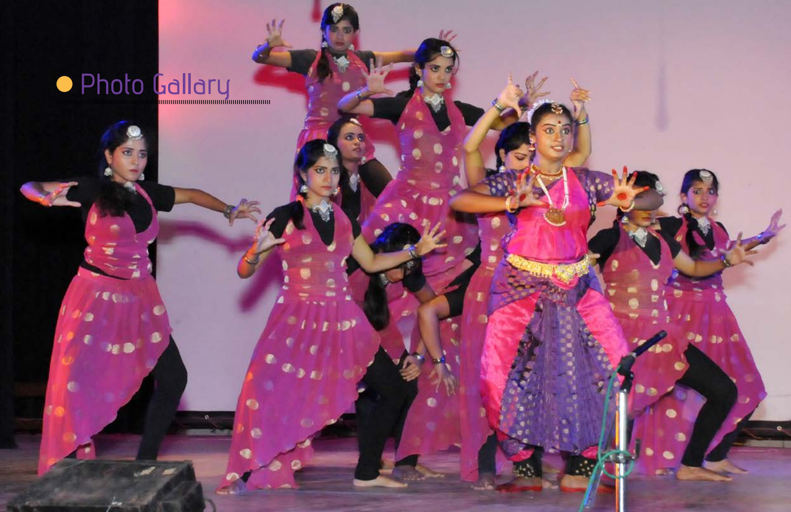
The Nupur Troupe in the Cultural Program for the NAAC Team.