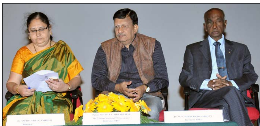
HOD, Botany, interacting with the participants during the lab session.