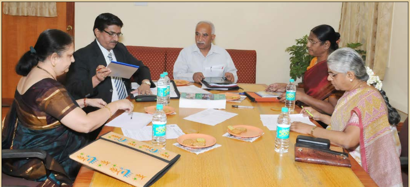
The Principal and Vice-Principal with the NAAC Peer Team in the office.