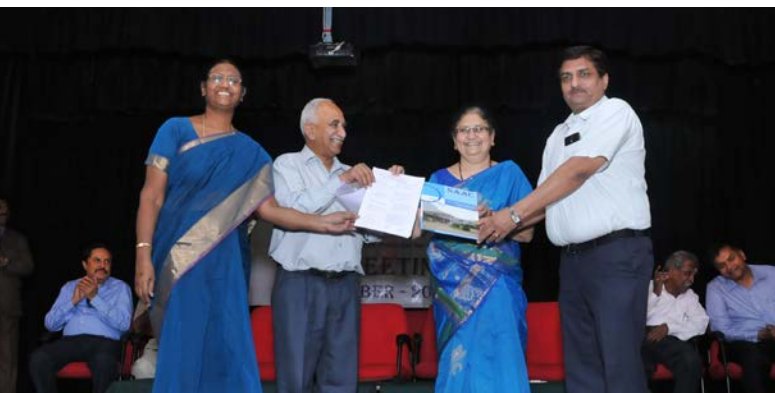
The Principal and the NAAC Peer Team at the Exit Meeting.