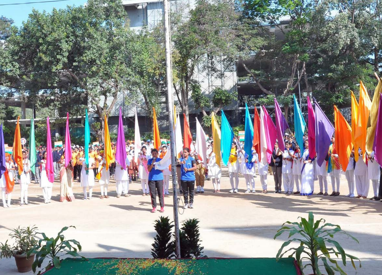
Class Representatives at the oath taking ceremony on the Athletic Meet.