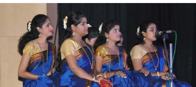
The Ninaada Troupe in the Cultural Program for the NAAC Team.