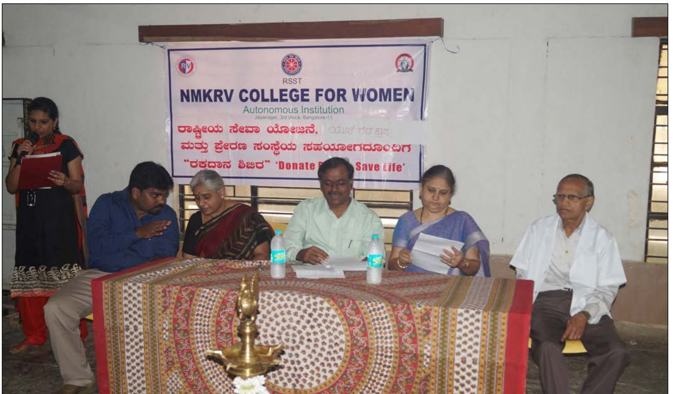
The Principal, Vice Principal, Coordinator and other dignitaries at the Blood Donation Campaign.