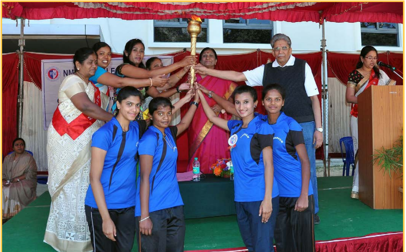
The dignitaries with the torch bearers.