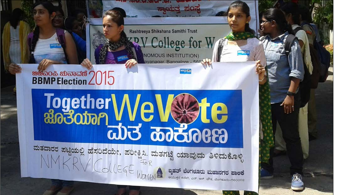
The NSS Volunteers in a rally concerning the importance of Voter Awareness.