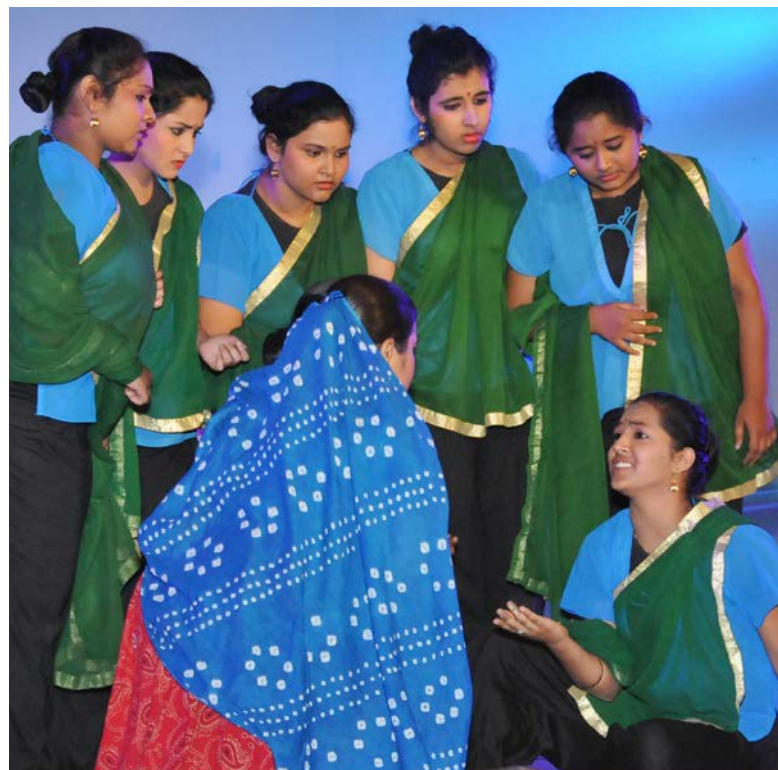
The Natya Troupe in the Cultural Program for the NAAC Team.