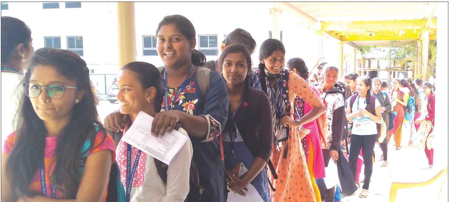
Students at the health checkup camp.