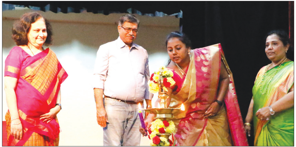
Lighting of the lamp by the dignitaries

Dignitaries on the dias congratulated the department for the initiative taken to encourage the students to develop the art of writing. This was followed by a series of lectures by eminent