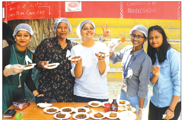
Food stalls organized by the students