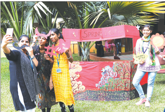
Students clicking pictures at the photo booth.

Competitions like Quiz, The Artists' Corner, Book Cover Design, and Western Ethnic Walk were organized for students. Other events included games like luck with books, guessing game etc. Charts and models of poems, sonnets, prose and stories were displayed. Students dressed up as characters from various novels welcomed the audience and presented a fashion show. A 'World Food Street' with global cuisines, local snacks and other food items was also organized in the quadrangle.