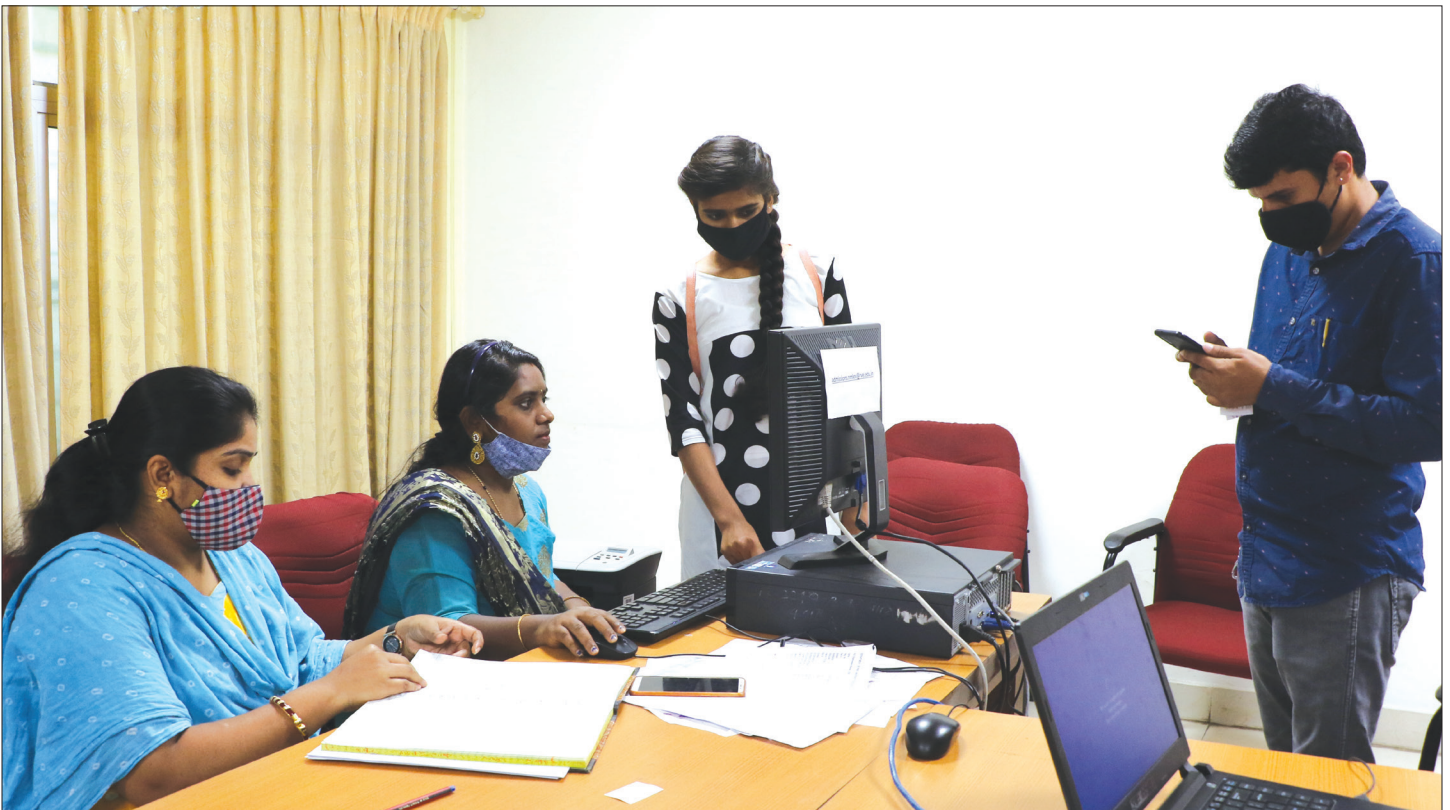
Online admission for academic year

Making aware of the concept of distance learning rules and designing formative questions, tests and exercises to monitor students' learning process.