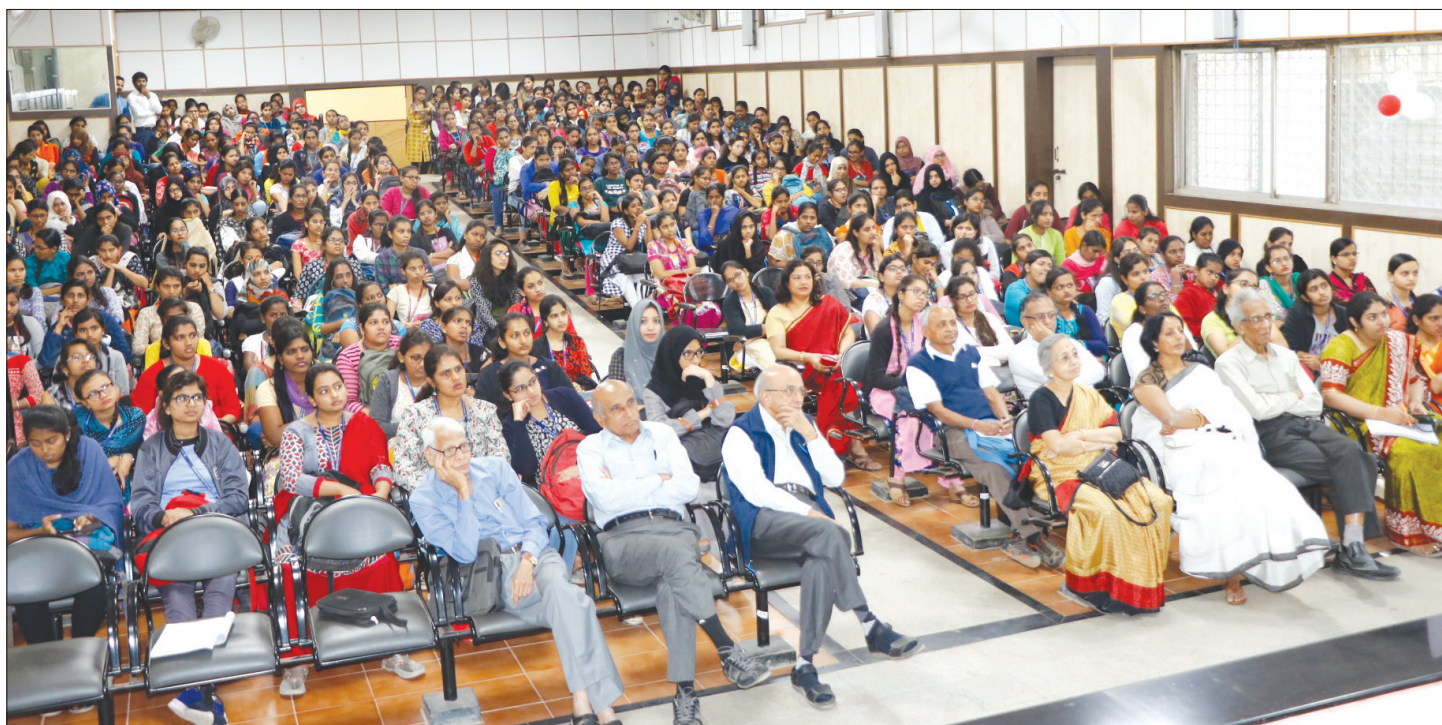
Special invitees and participants at the event.