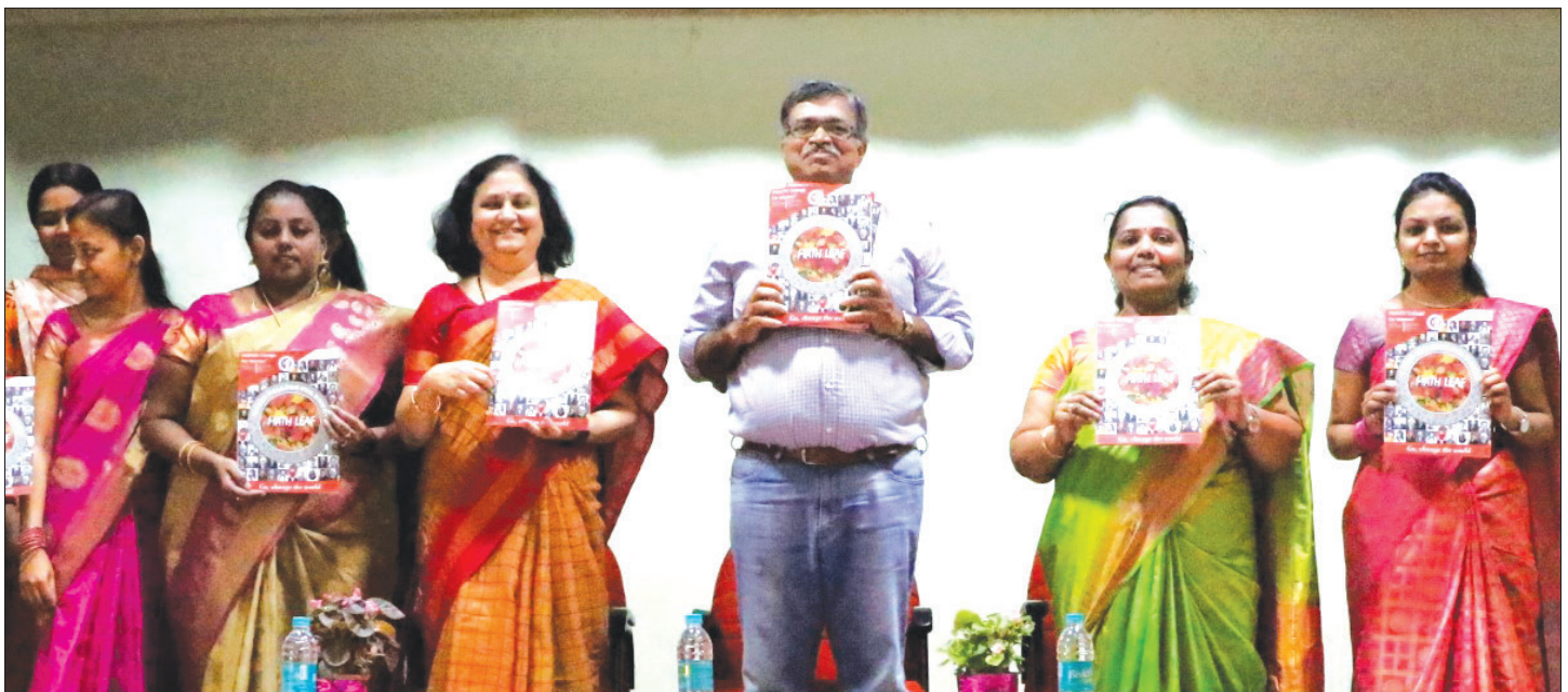
‘MATH LEAF’ magazine release