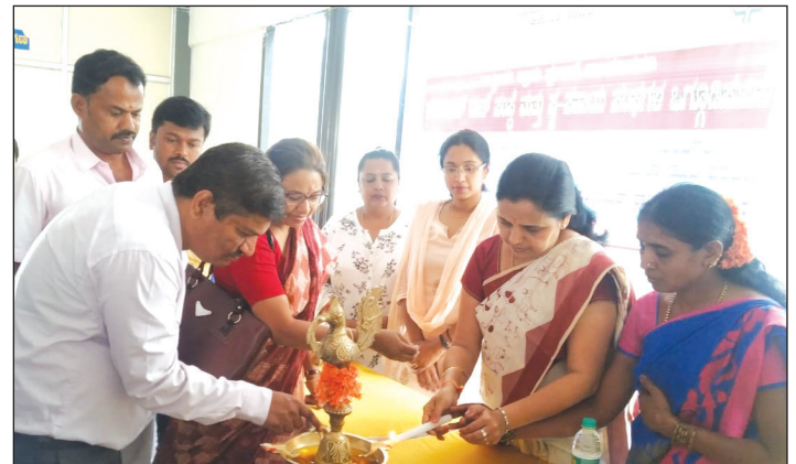
Inauguration of Cancer Awareness Programme for self-help group members was organized by UBA cell in association with Parvutsaha Foundation at Chikkanahalli