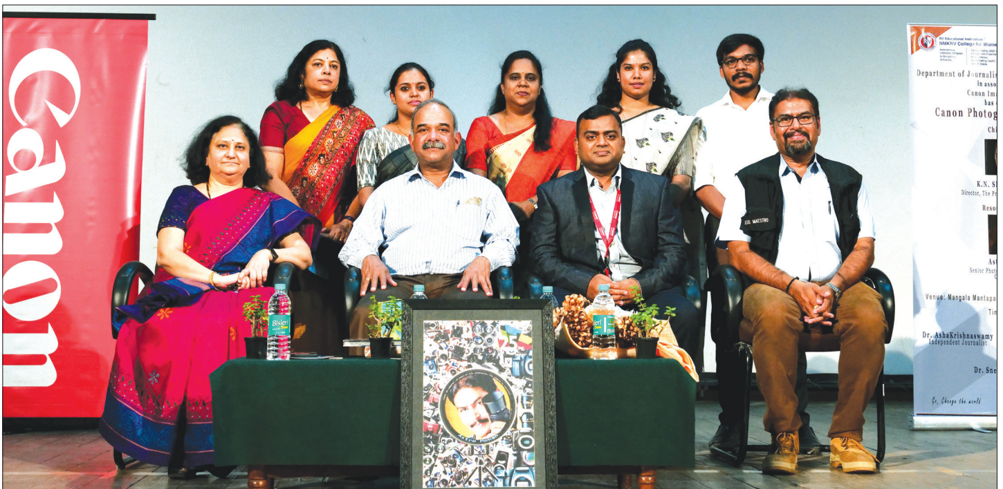
Dignitaries along with the organizing committee.

the students to different types of cameras and taught the techniques of photography. He practically trained the students by letting them click pictures in professional cameras. Certificates were distributed to all the participants at the end of the workshop.