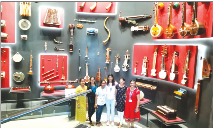
Ninada students exposed to different musical instruments at the music museum 'The Indian Music Experience'