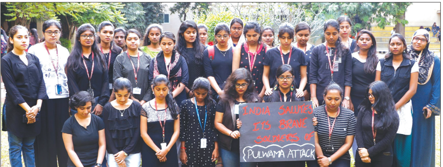
Journalism students paying tribute to the martyrs of Pulwama attack.