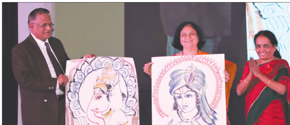
Live sketching by one of the alumni.