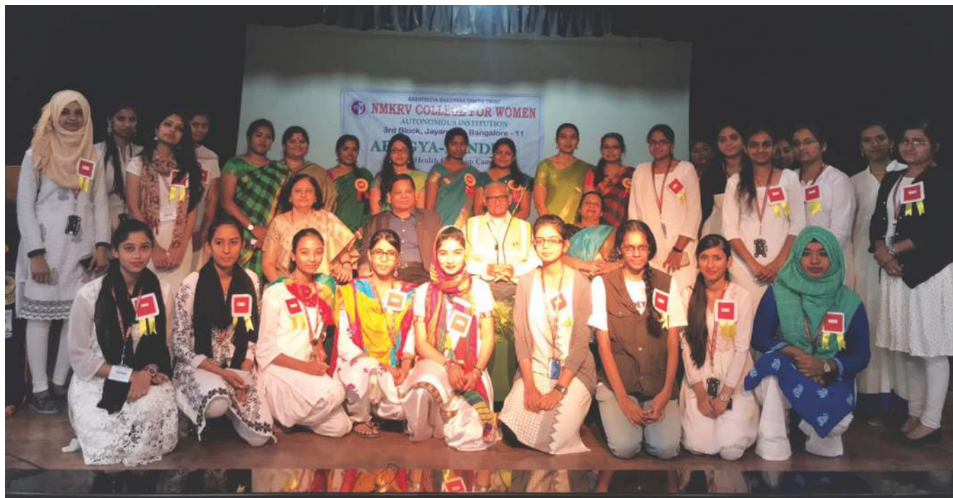
Health check-up camp, dignitaries along with members and volunteers of Arogya Kendra

The Annual Free Health Camp for all first year students was organized by Arogya Kendra of the college in association with Lions Club of Bangalore Mind Tree District 317 E, Srushti Foundation, Bangalore, Kempegowda Institute of Medical Science, Bangalore and East India Medical College, Bangalore on 7th February, 2019. Nearly 700 students availed the benefit of the health camp.