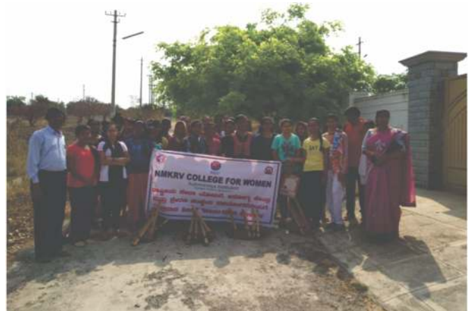
NSS coordinator, members and volunteers at camp