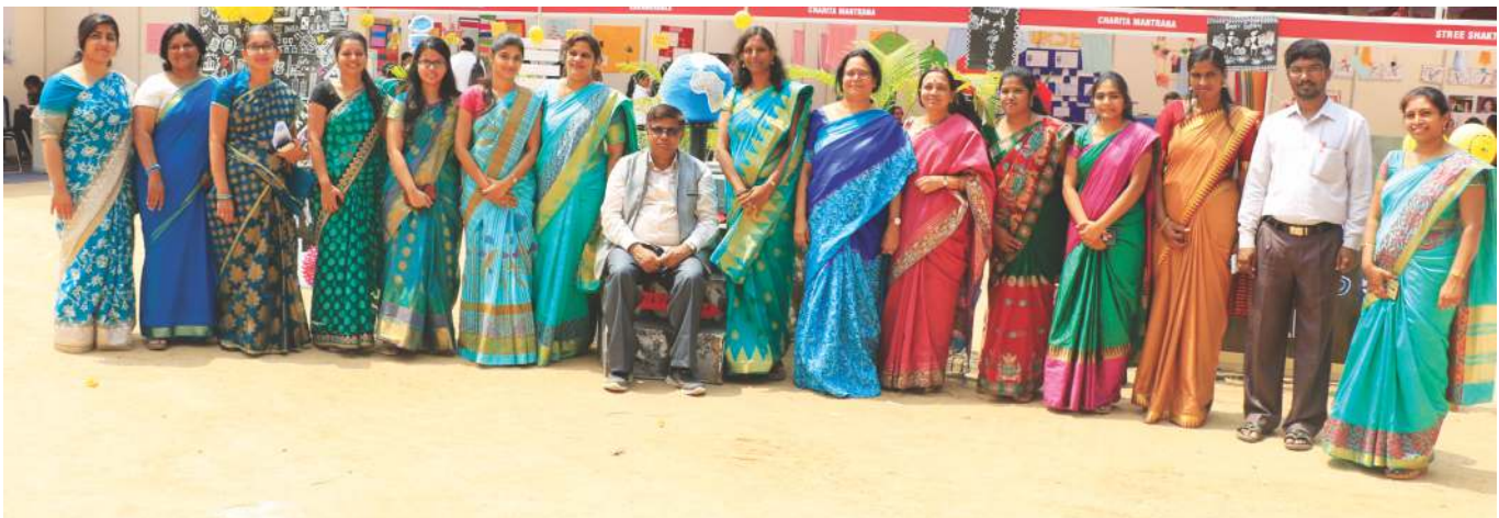
Organizing committee of 'Comercio Fiesta'

This was an initiative of the Department of Commerce to optimise the talent, resources, knowledge and skills of students and teachers.