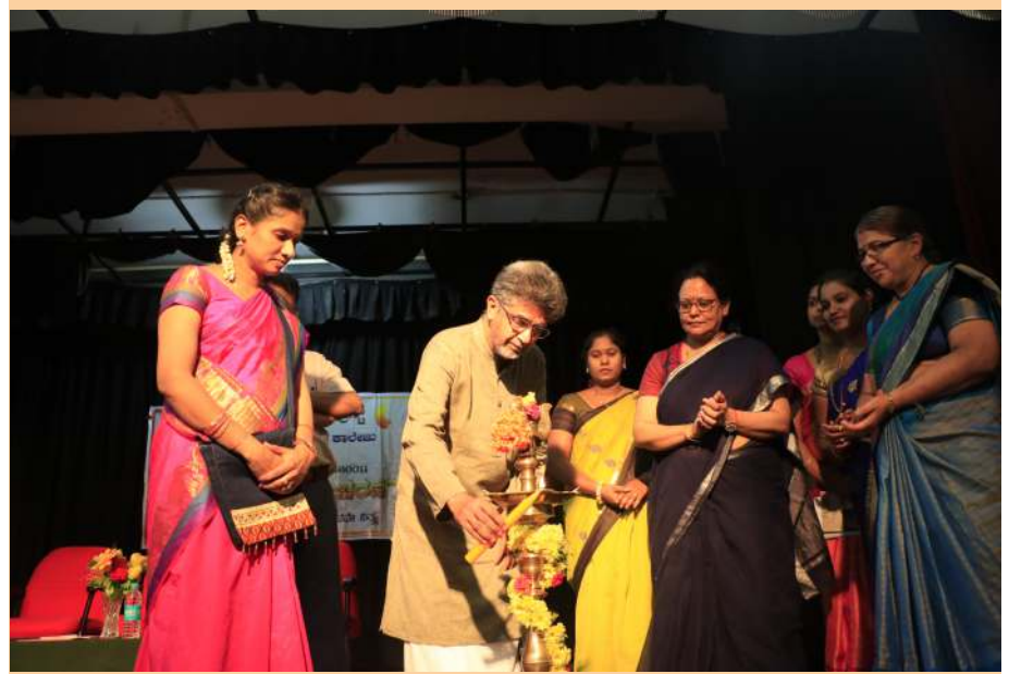
Inauguration of Kannada Day by Dignitaries