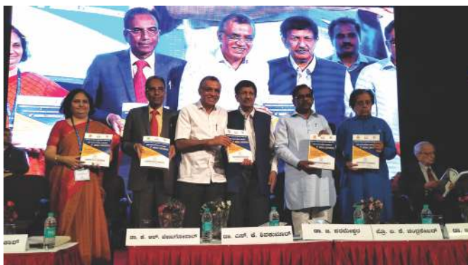
Dignitaries releasing the compendium of abstracts.