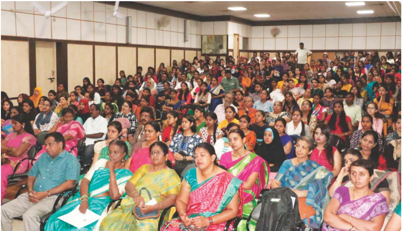
First years at the Orientation programme