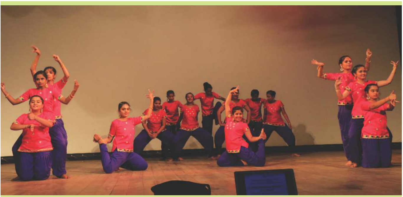
Nupur, dance team performing during Women's Day celebration