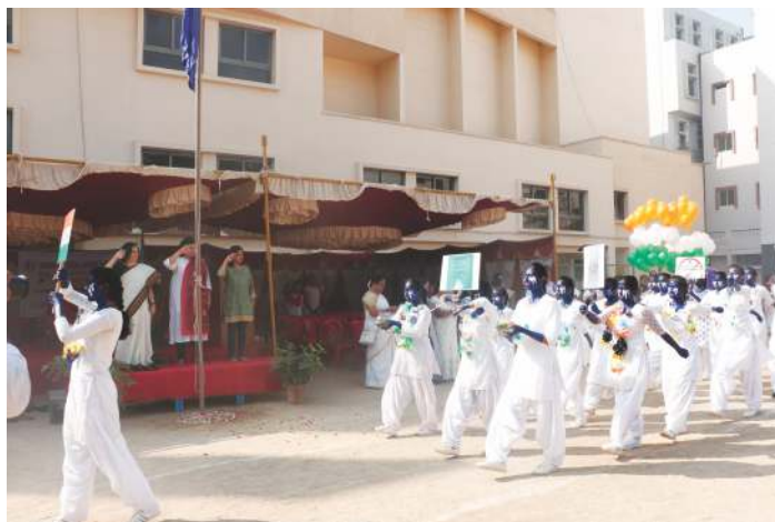
Students marching past the dignitaries