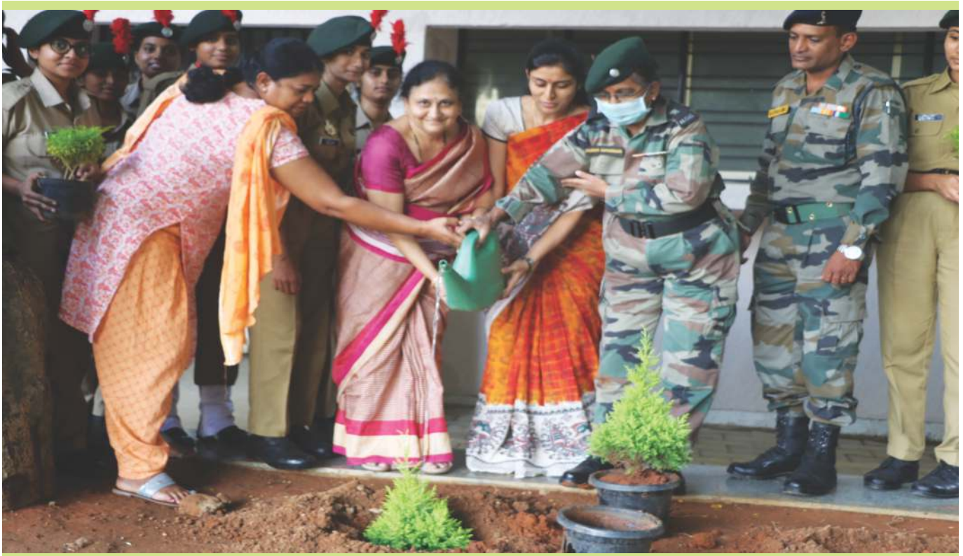
Dignitaries sapling plants during NCC orientation programme