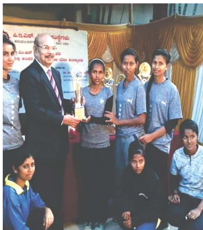
Students receiving trophy at PES College sports meet