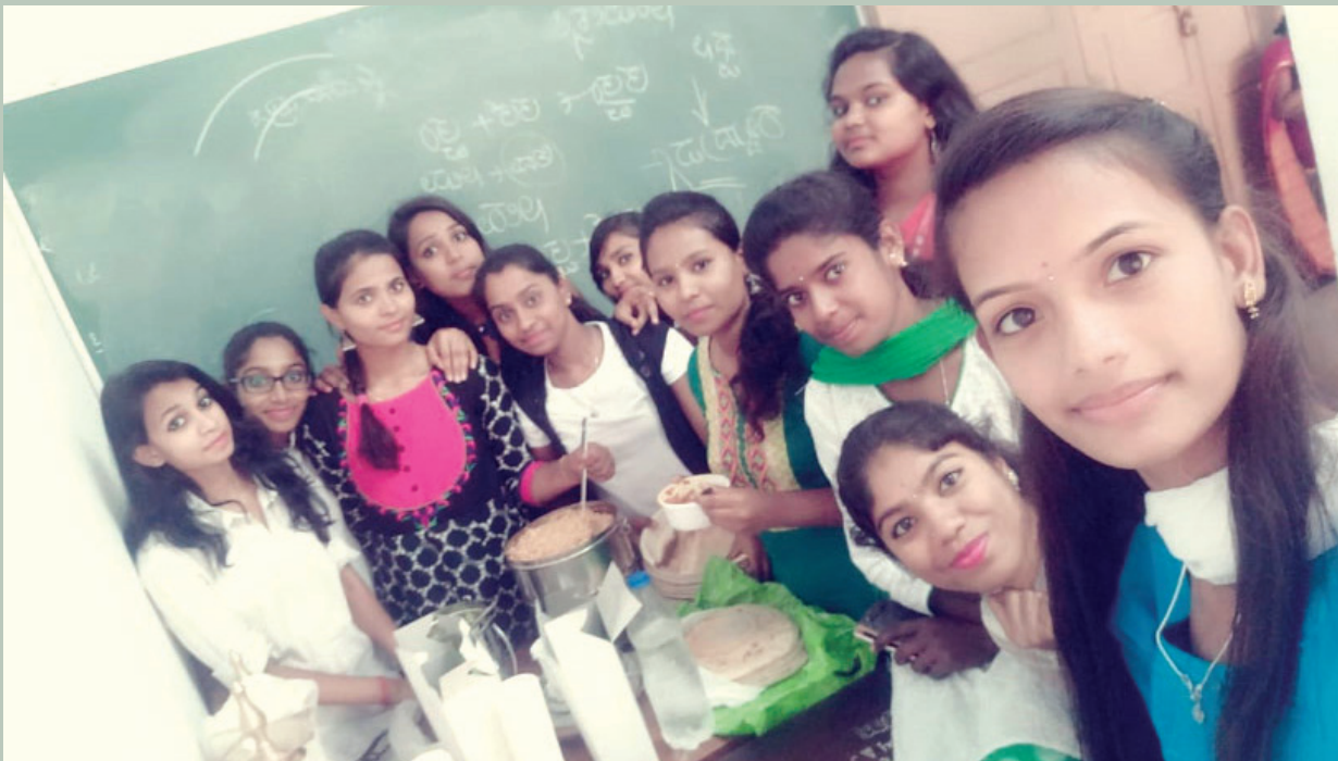
Students participated in the 'Care and Share Day' on 4 th Aug, 2018 organized by the Department of Sociology.