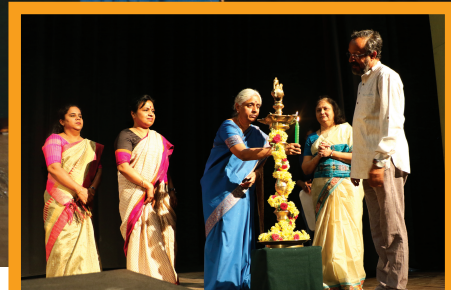
Dignitaries at Artlobe lighting the lamp.