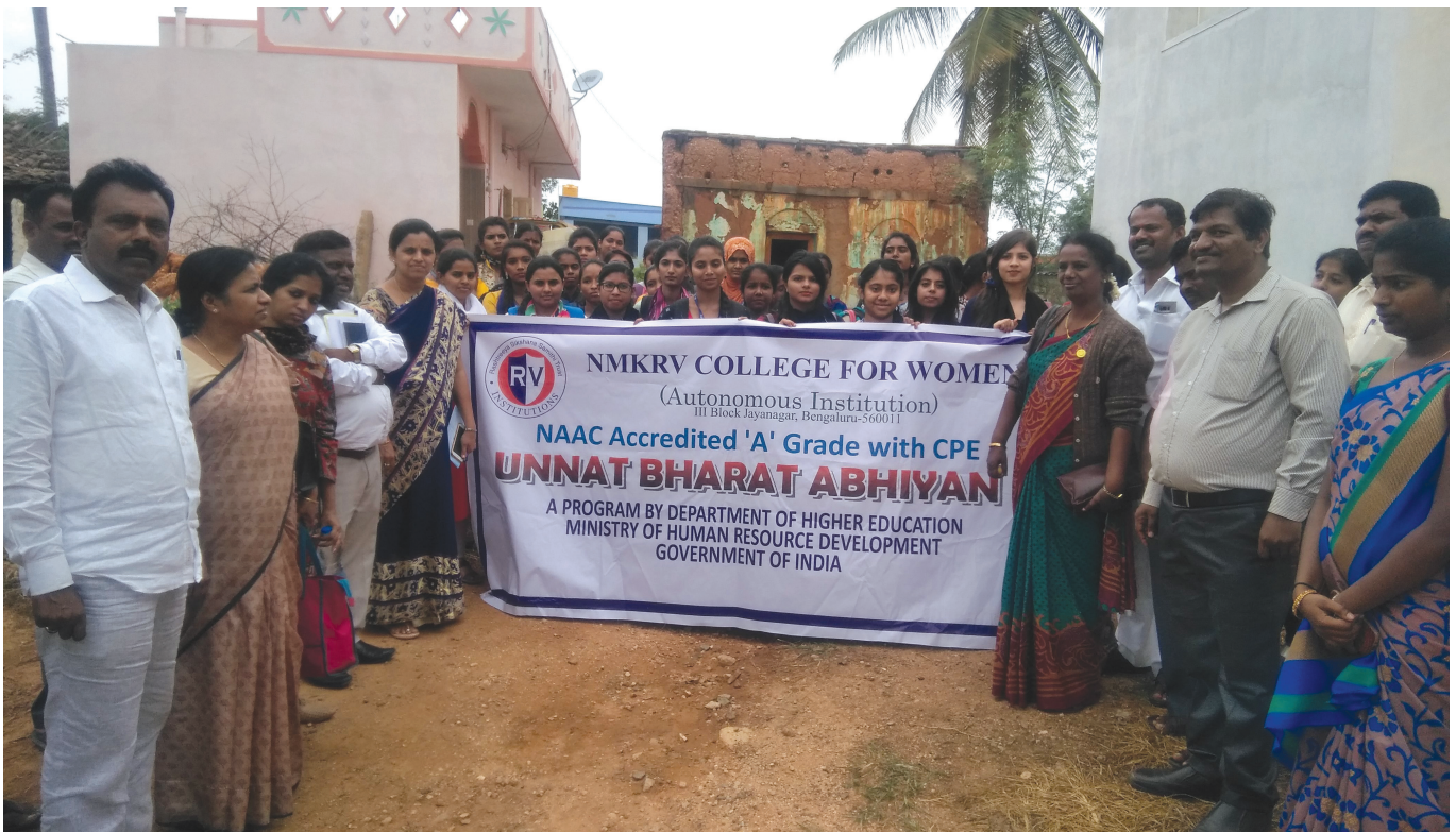
Faculty and students of Humanities visiting villages as part of Unnat Bharat Abhiyan scheme.