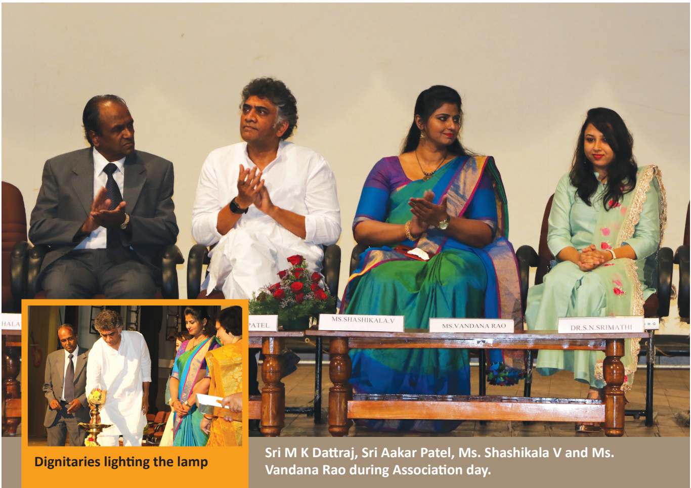
Dignitaries lighting the lamp