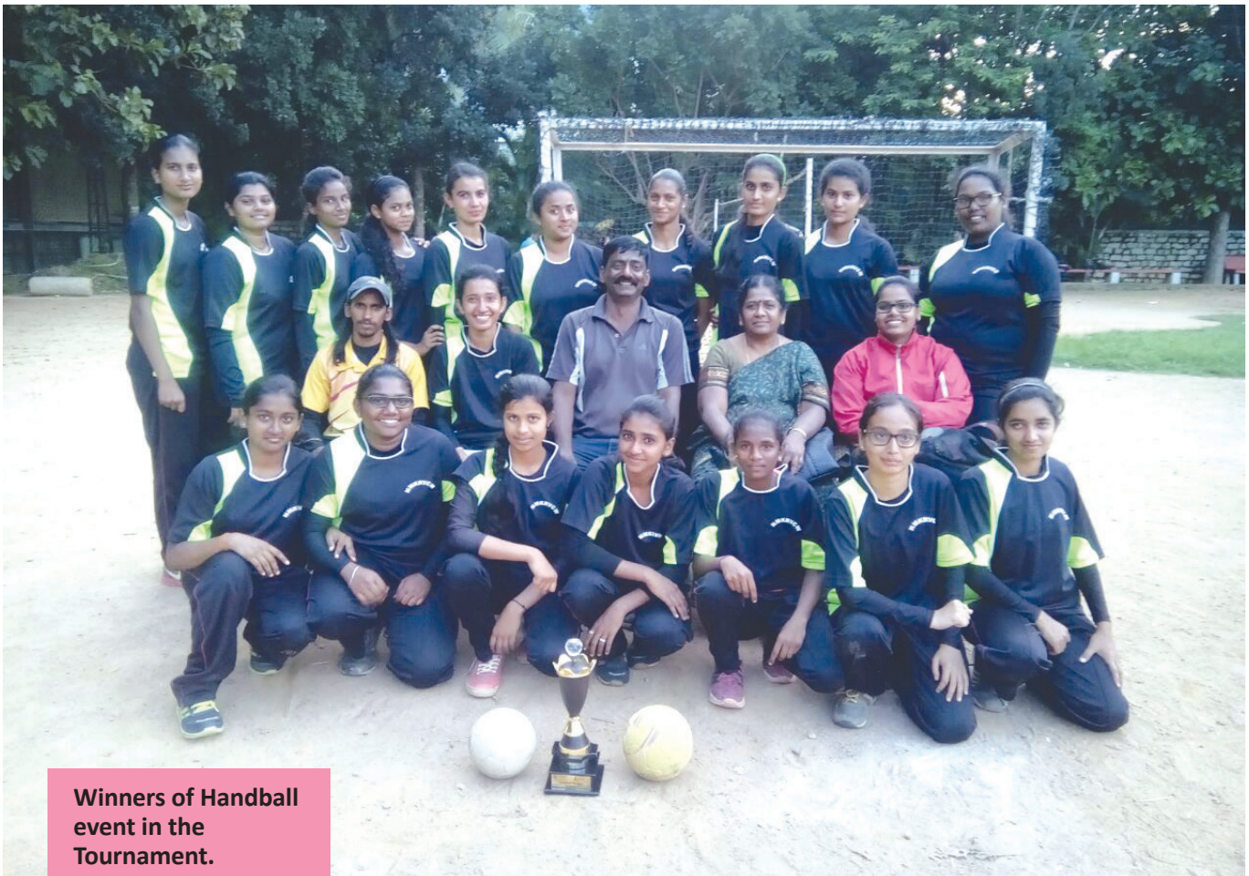
Winners of Handball event in the Tournament.