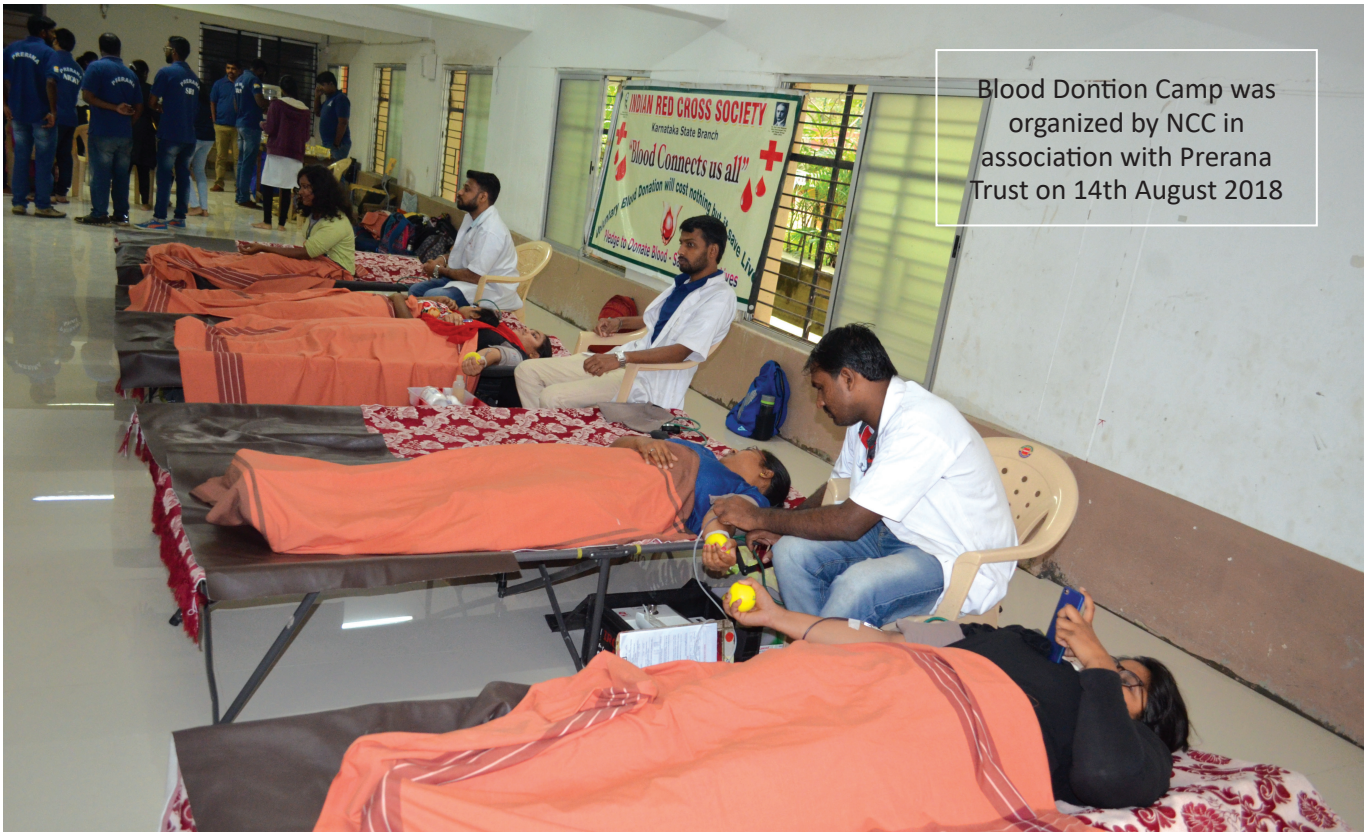
Blood Donation Camp was organized by NCC in association with Prerana Trust on 14th August 2018