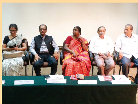
UGC Autonomy Extension Review Committee visited the College on 23rd and 24th April 2018

NIRF has already released the ranking list for national institutions in 2016 and 2017. Despite the criticisms, the ranking methodology motivates the institutions to make every effort to achieve excellence and face the global competence. As of now, MHRD has made NIRF a voluntary exercise for the institutions. But, soon it will be made mandatory. Hence, it is the right time to gear up to face the NIRF assessment.