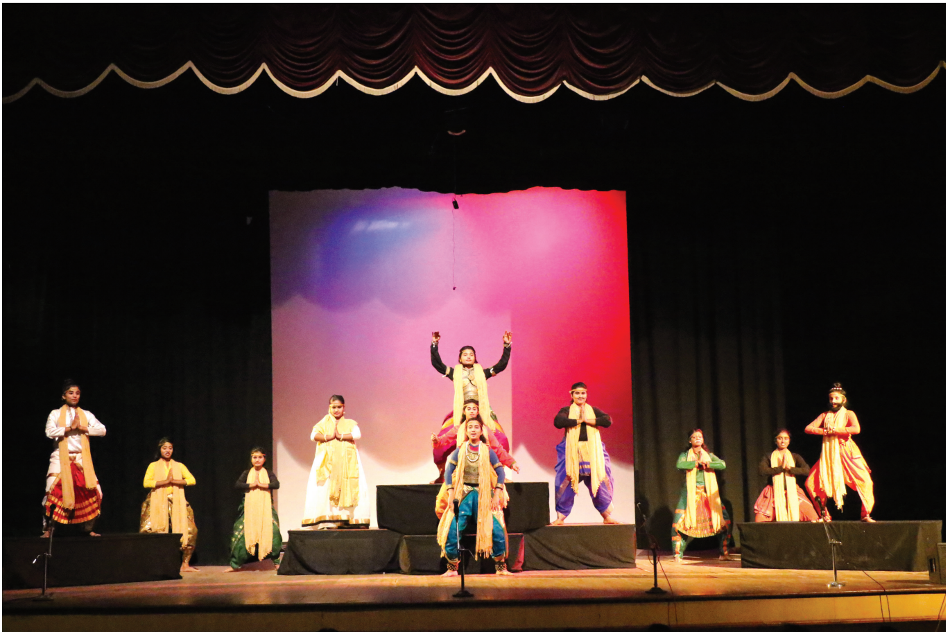
Students during the performance.