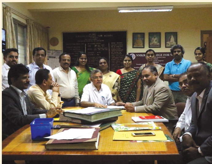
Research Review Committee of Bangalore University Visited the College on 07th August 2018