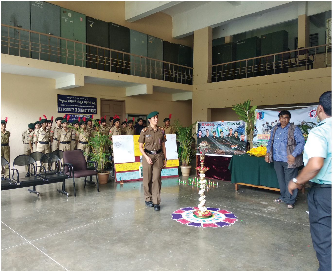
NCC Officer and Cadets observing the proceedings.