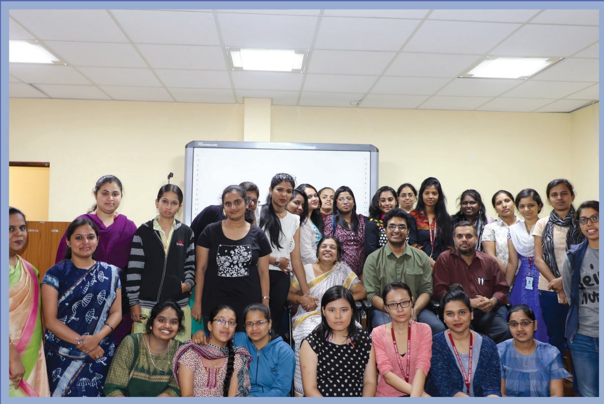
Chief Guests, Faculty and students of MAJMC celebrating World Radio Day on 12th March 2018.