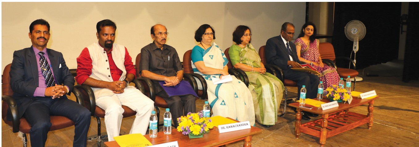
The dignitaries on the dias at the inaugural ceremony of Hypnosis Seminar.