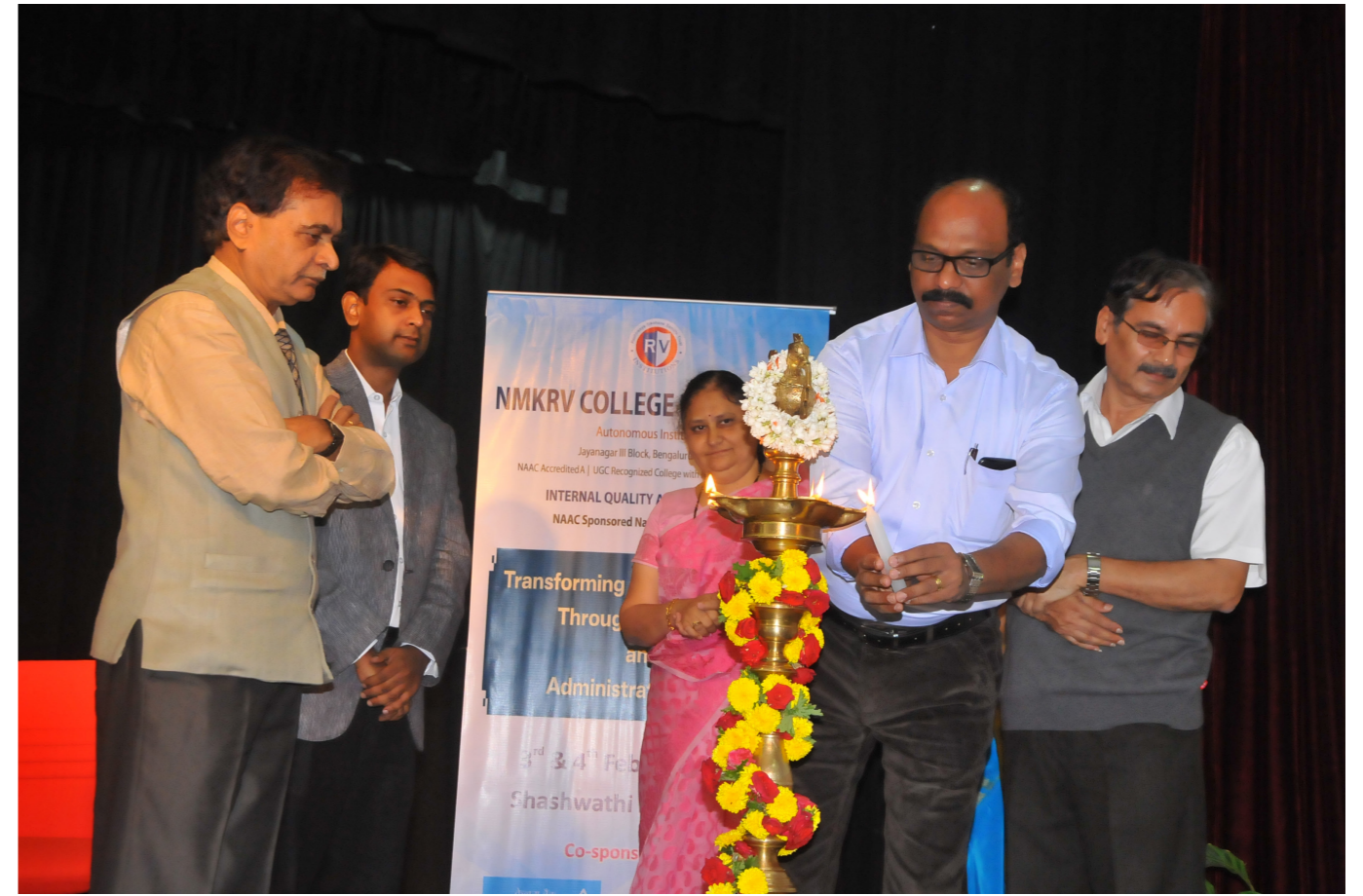
Inauguration of the Conference by the dignitaries