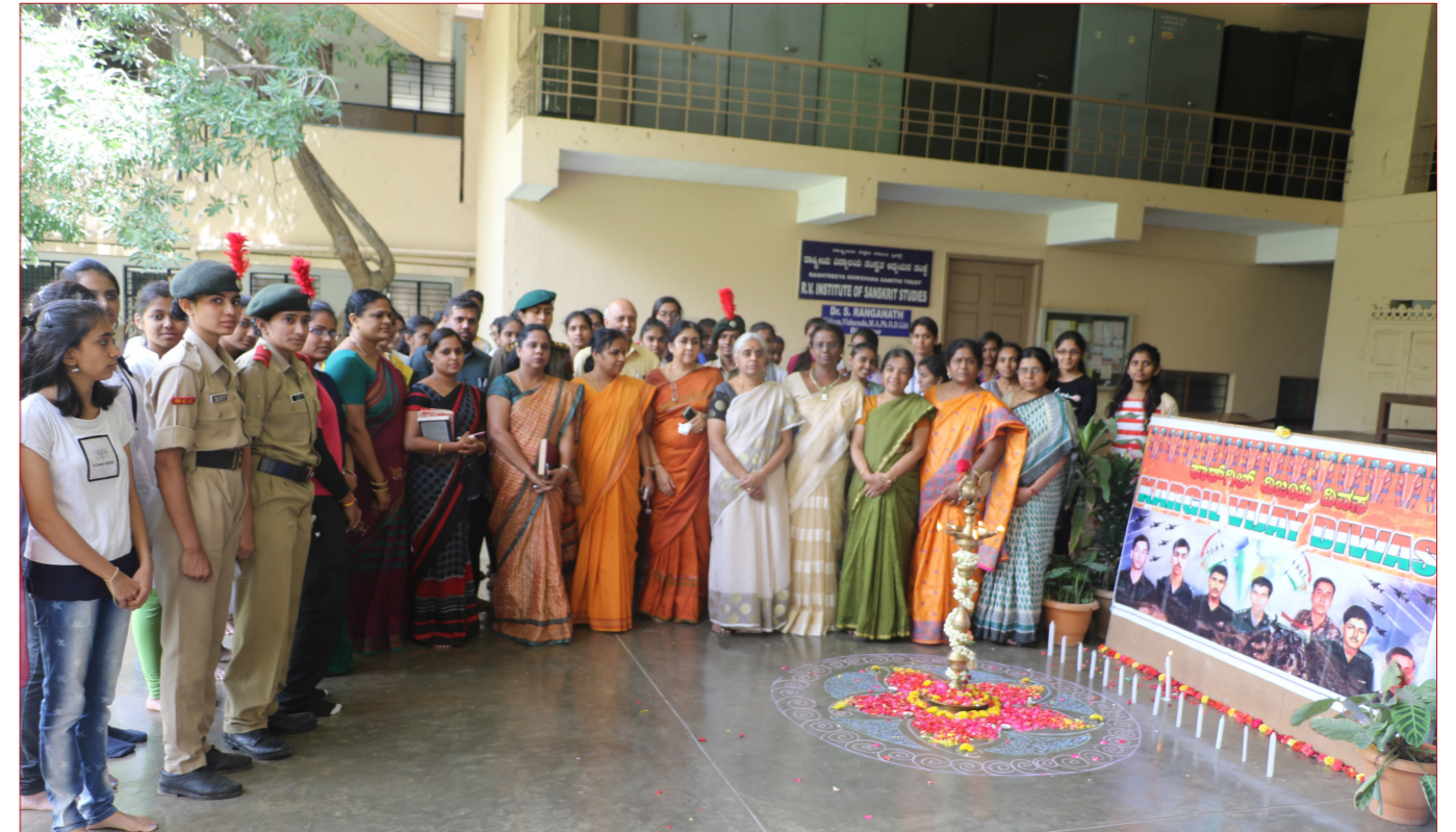
The NCC wing of the College observed the Kargil Vijay Divas

Kargil Vijay Diwas was celebrated to commemorate the recapturing of all the Indian posts in Kargil by the Indian army troupes on July 26, 2017. This event observed annually to commemorate the sacrifices made by soldiers in this war.