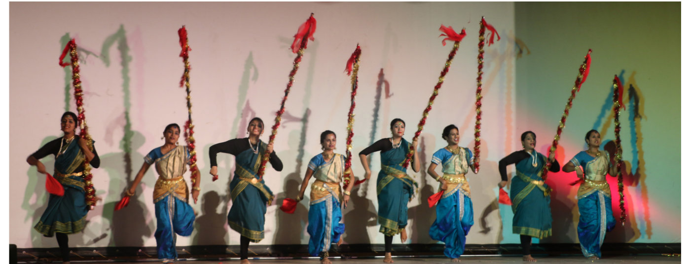
Cultural programmes by the students