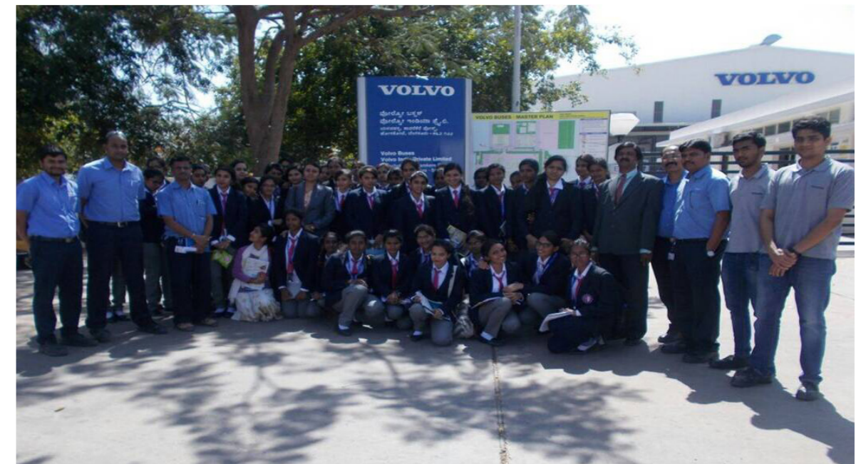
The students of 1st year BBA visited "VOLVO India pvt.Ltd.," Hoskote, Kolar District, on 30-1-2017