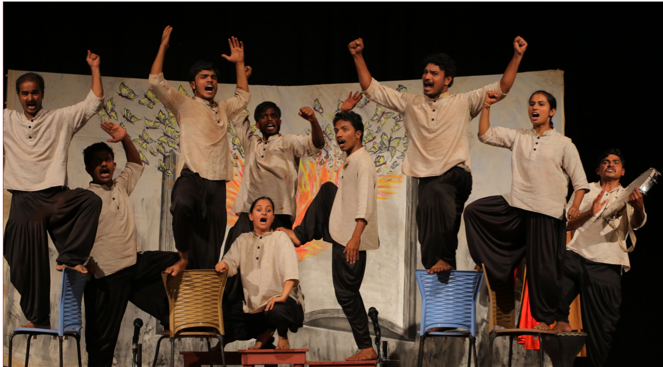
Dharwad Repertory presented the play Kavyaranga which showcased the essence of Kannada literature.

The Samudaya Dharwad Repertory, a theatre group presented a play, "Kavyaranga" in the Mangala Mantapa on 3rd August 2017, for the staff and students from all streams. The program was jointly organized by the Departments of English and Kannada.