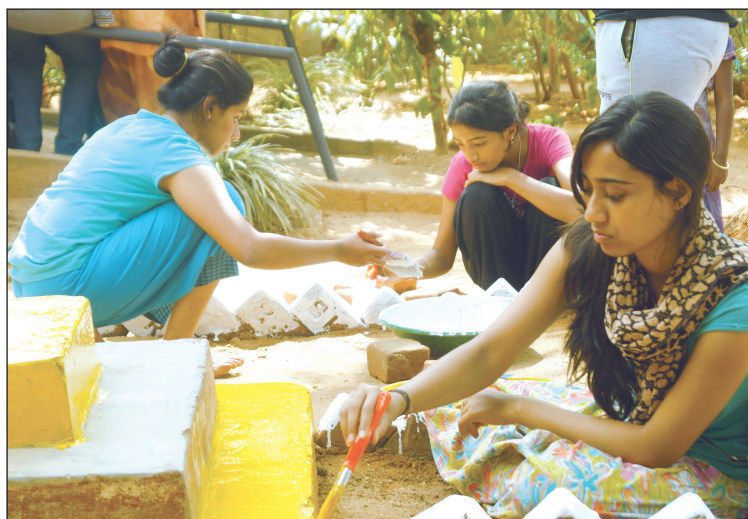
NSS students field activity.