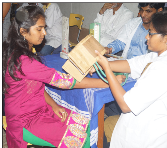
NSS team organized a blood donation camp.