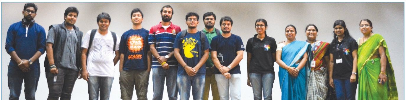
Winners were given prizes at the valedictory function.

Udupa was held. Competitions like Group Singing with a folk theme, Photography, Lecture competition with the theme 'Make in India' and Dumb Charades took place. At the end of the day, winners were awarded with prizes at the valedictory function in Shashwati Auditorium.