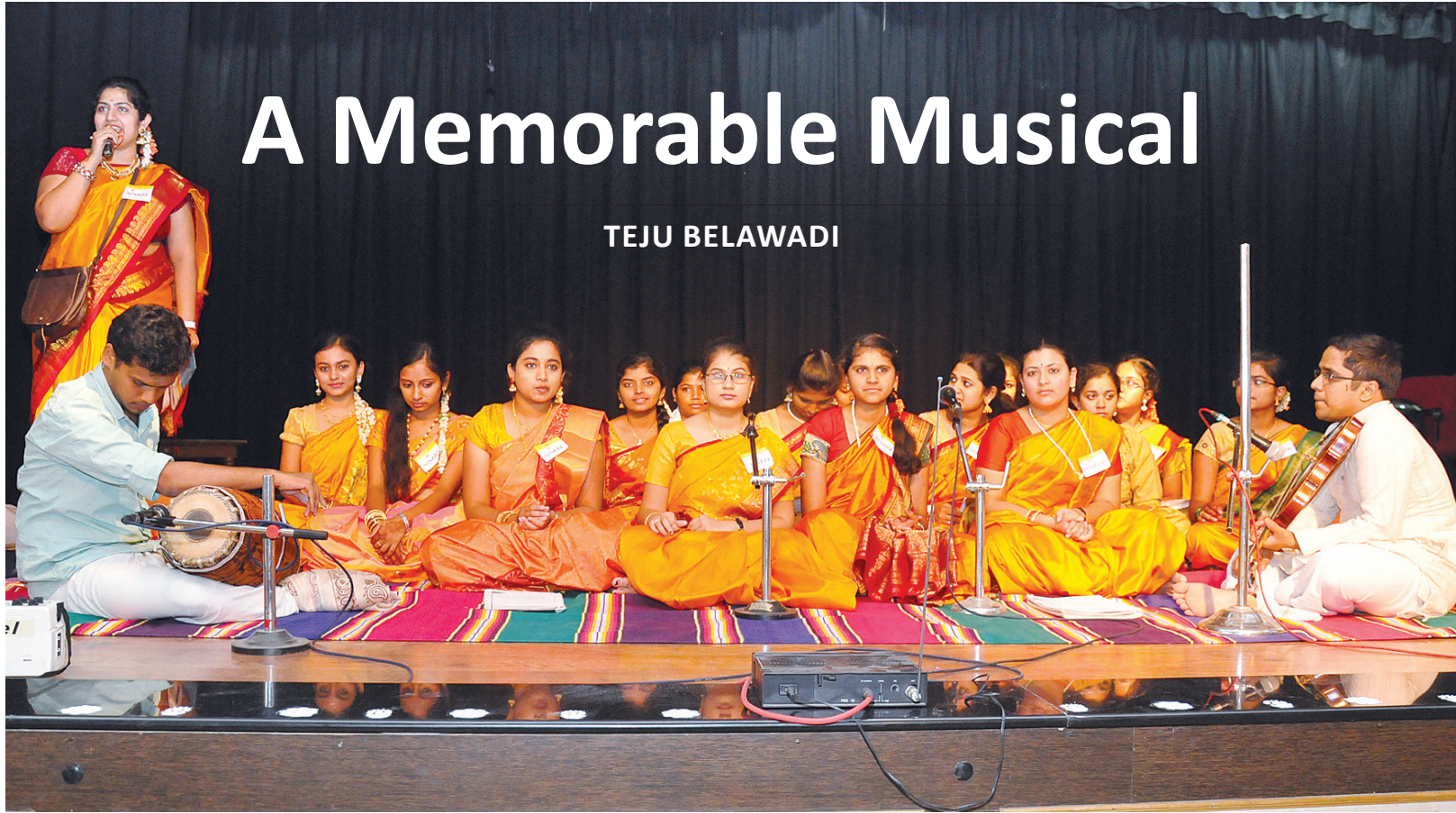
Play 'Thyagaraja Charitha' performed by students of Ninaada troupe.