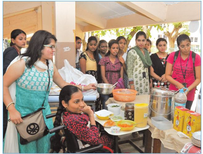
Students from various colleges participated in fest activities.