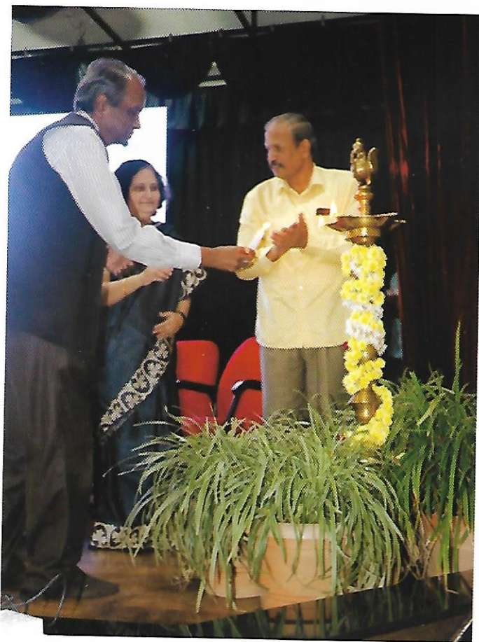
Lighting of lamp by the dignitaries

One day National workshop on 'NIRF Ranking Focus on Data Capturing System for Higher Educational Institutions' was organized in association with Institute for Academic Excellence, Hyderabad at Shashwati Auditorium on 20th November, 2019.