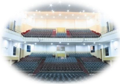
Mangala Mantapa - 800 seaters