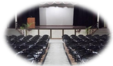
Auditorium - 300 Seaters