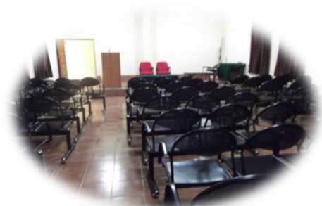
Auditorium - 100 Seaters